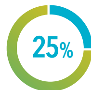
NORTH AMERICAN STEEL ALWAYS HAS AT LEAST 25% RECYCLED CONTENT

When it comes to sustainability, steel can’t be beat. Each year, more steel is recycled in the U.S. than paper, plastic, aluminum and glass combined. “It’s one of the few construction products that is not only recycled routinely, but it can be 100% recycled—meaning any steel product can be recycled into any other steel