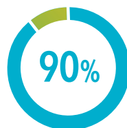
A STEEL BEAM IN NORTH AMERICA HAS +90% RECYCLED CONTENT